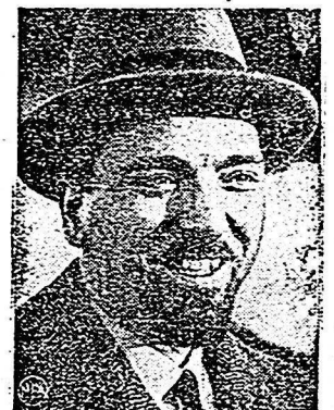
Count Dino Grandi, above, one of Mussolini's original black shirts and a former Italian foreign minister, is rumored as a successor to Badoglio if latter quits the premiership.