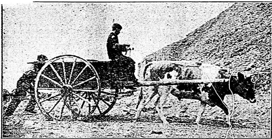
An ox-cart is a familiar sight throughout the Gaspé Coast region and is one of the unique elements of local colour to be seen in the trips to ancient Quebec.