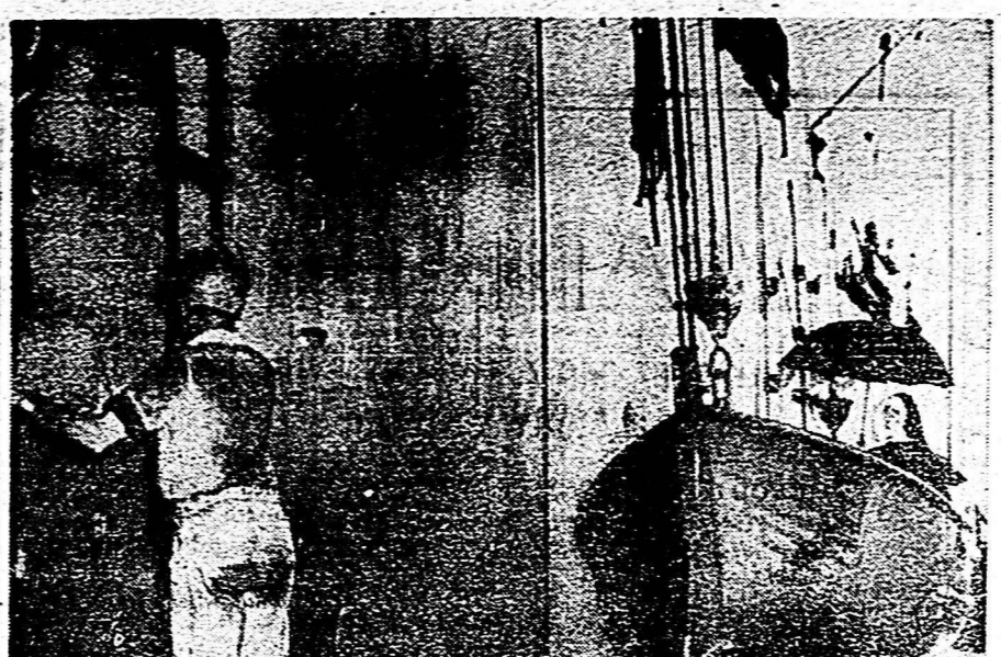
Shielding themselves from the tropic sun with umbrellas, as imperturbably as if being lowered over the side of a warship in a battle area were a commonplace occurrence, sisters of the Catholic Order of Mary Immaculate are pictured arriving at Guadalcanal. Stationed on another Solomon Island, they were captured and held until rescued by American forces. Two priests and a nun were killed before the Americans arrived.