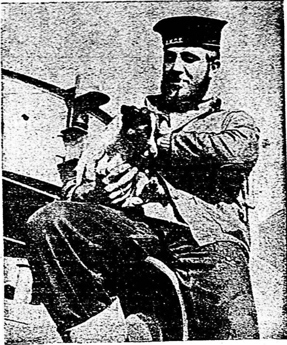
Every fighting ship of Canada's ever-expanding Navy, seems to have a mascot of some kind. Many have dogs whose pedigree has long been forgotten like the pooch above. Subjected to all sorts of kindhearted rough and tumble treatment from the crew, they very often will never leave the ship when in port.