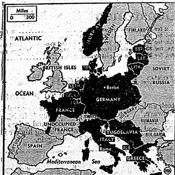
For the first time in many years, the United States is without direct consular service in 14 European countries. Nations blanked out on map are those from which consuls were ousted. Embassies remain open in Berlin and Italy.