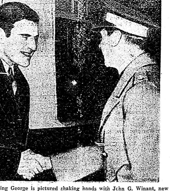
King George is pictured shaking hands with John G. Winant, new United States ambassador to the Court of St. James, upon his arrival in England.