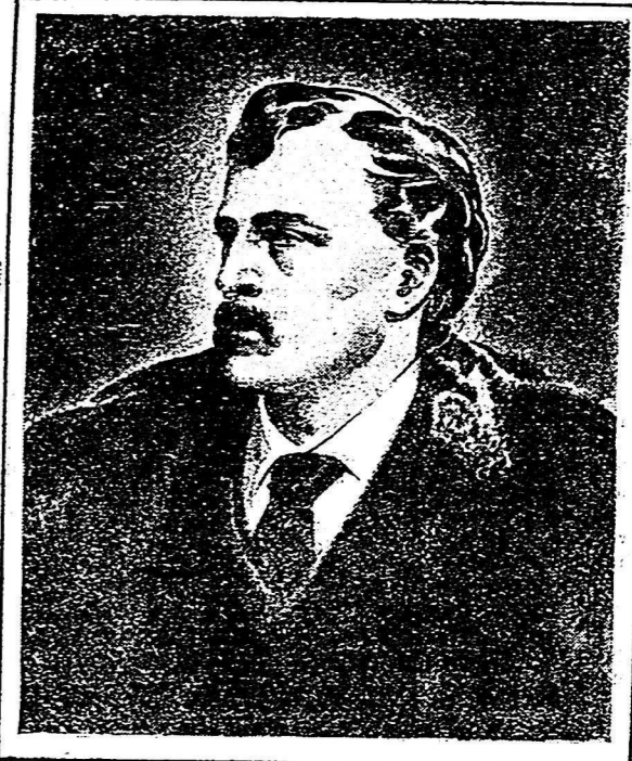
THE MARQUIS OF LORNE, K.T., G.C.M.G. GOVERNOR-GENERAL OF CANADA, 1878-1893