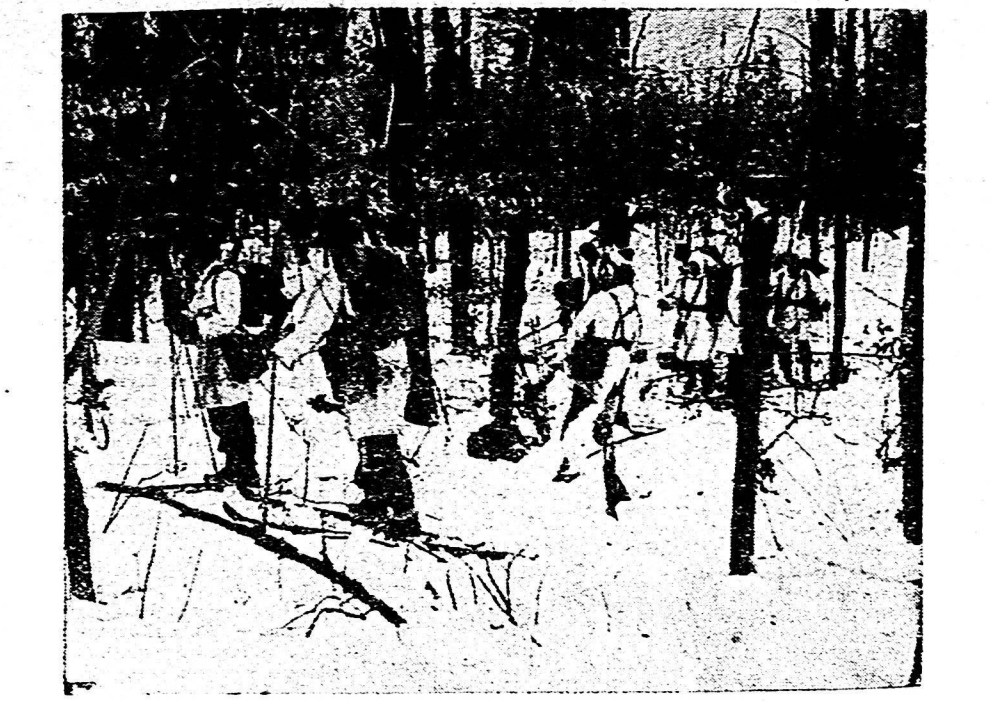
A halt is called and a spot chosen for the non-day meal in the woods after ski instructors of the Canadian Army have spent long hours in cross-country training manoeuvres in the Gaitheuse hills.