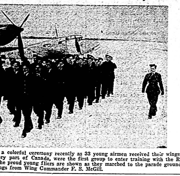
These young flyers were the scene of a colorful ceremony recently at the wing's headquarters. They are the first group to enter training with the R.C.A.F. after the outbreak of war. The proud young flyers are shown as they marched to the parade ground where they received their coveted wings from Wing Commander F. S. McGill.