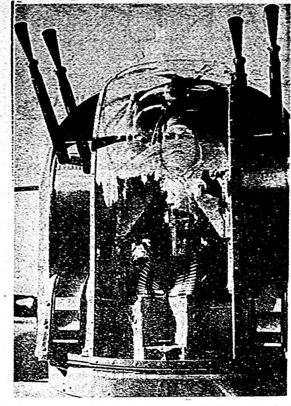
A view of the "blitzer" on the tail of a British bomber, showing the gunner who operates the four machine-guns that are calculated to take care of an enemy attacking the rear of the plane.