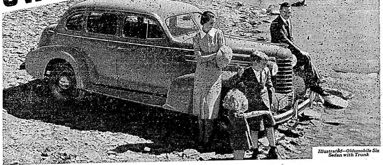
Illustrated—Oldsmobile Six Sedan with Trunk

OLDSMOBILE "SMARTEST CAR OF THE YEAR .. SMARTEST BUY OF THEM ALL"