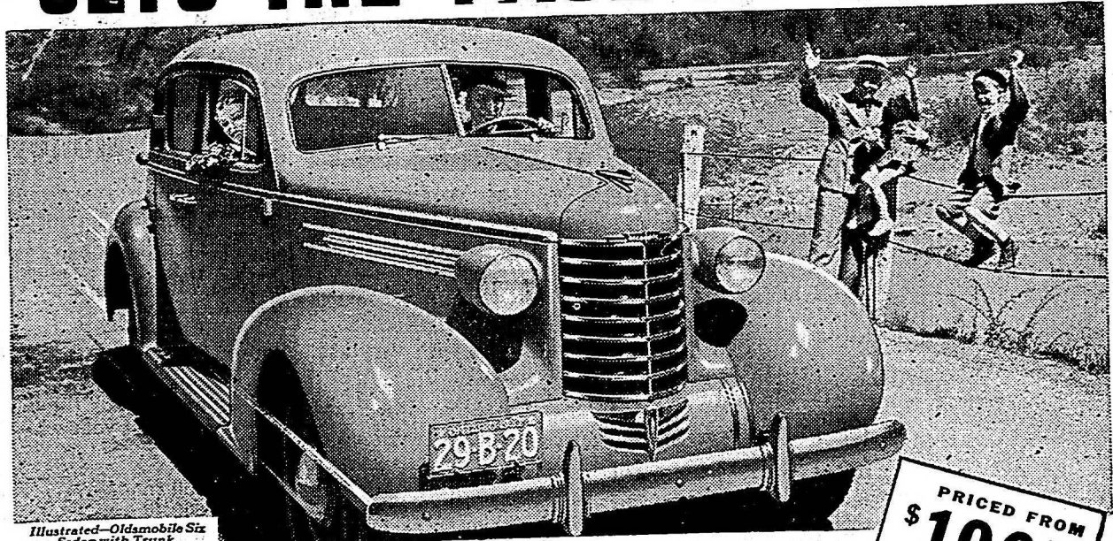
Illustrated—Oldsmobile Six Sedan with Trunk.