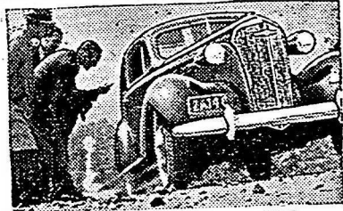
85-H.P. VALVE-IN-HEAD ENGINE

Watch costs, when you're deciding on your new car! Compare prices, gasoline mileage, oil economy, upkeep expenses . . . and you'll choose Chevrolet, the car that inspired the famous phrase, "for Economical Transportation". Look out for values, too! Compare features, and you'll never take less for your money than Chevrolet offers. Unisteel Turret Top Bodies by Fisher, for beauty and protection. Self-energizing Hydraulic Brakes for safety. Valve-in-Head Engine for performance with thrift. Knee-Action (in Master De Luxe models) for the matchless "gliding ride". Fisher No-Draft Ventilation for health, and clear vision in wet weather. Safety glass in every window for peace of mind. See—drive—the complete car in the lowest price field today! Buy on low monthly payments, through the General Motors Instalment Plan.