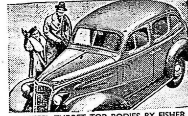
UNISTEEL TURRET TOP BODIES BY FISHER