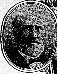
Sir William C. Macdonald.

General view of Macdonald College Buildings St. Anne de Bellevue, Que.