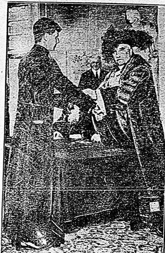
Time-honored ceremony was participated in when the Lord Mayor of London presented head boy of Christ's Hospital School, Horseham, with a guinea.