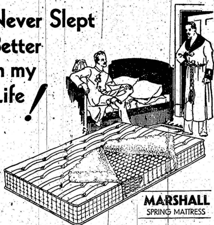
MARSHALL SPRING MATTRESS

You can work harder, play better, prosper more if you have the right kind of sleep. Hundreds of tiny springs in the Marshall Spring Mattress form a resilient spring centre that conforms to and supports every curve of your body—result—luxurious comfort—perfect rest—truly health-giving sleep.