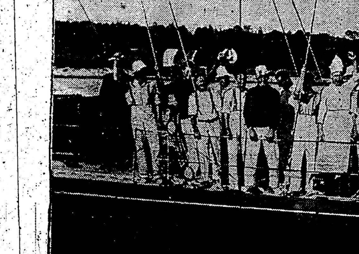
Crew of St. Thomas Lipton's Shamrock V. as seen from coast-guard cutter as they passed Race Point, off New London, Conn., upon recent arrival from England for America's Cup race.