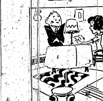
Hubby: 'Well, what was there Mr. Jones' evening gown?' Wife: 'Very little besides style, my dear.'