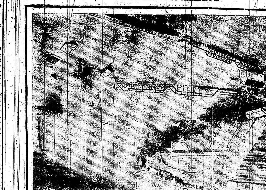
RAGING FLOOD WATERS IN TENNESSEE SWEEP AWAY BRIDGE. Heavy rains and swollen waters did heavy damage at McMinnville, Tenn., sweeping away a portion of the bridge in the swirling torrent.