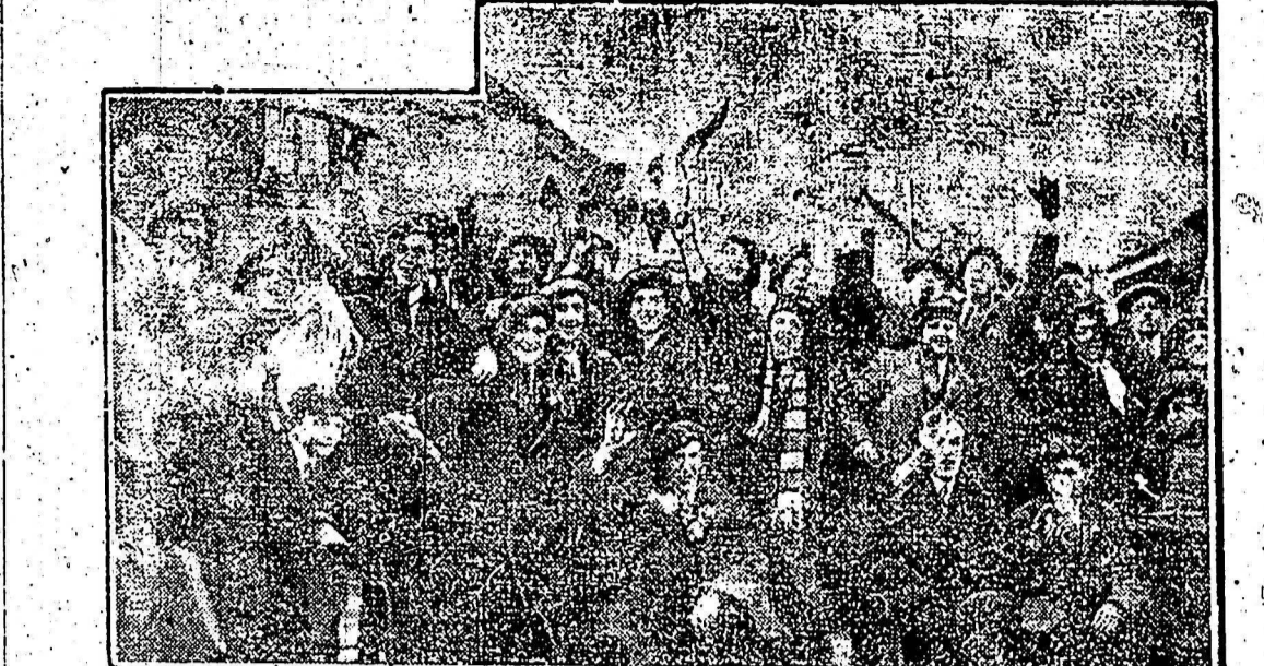
CHEERING SCOTSMEN INVADED PUTNEY FOR THE UNIVERSITY BOAT RACE. The happy fans of the kind of event had formed a ring to watch the rowing match between Scotland and England, and it was not until the race was well under way that they made the most of the opportunity by taking to the boat race too. One day covered both events.

The men we are training are not those who have been demoralized by war. They had nothing to do for years. After a hard training they have Great Britain and after a thorough test in the case of families, the women do not consider the type that will make good as farmers' wives. The selected family is required to the regiment and another takes its place for testing and training.