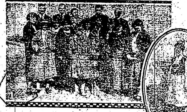
1. A group of Norwegians photographed after having spent a few years in Canada. 2. Young girl dressed in the costume typical of her native country.