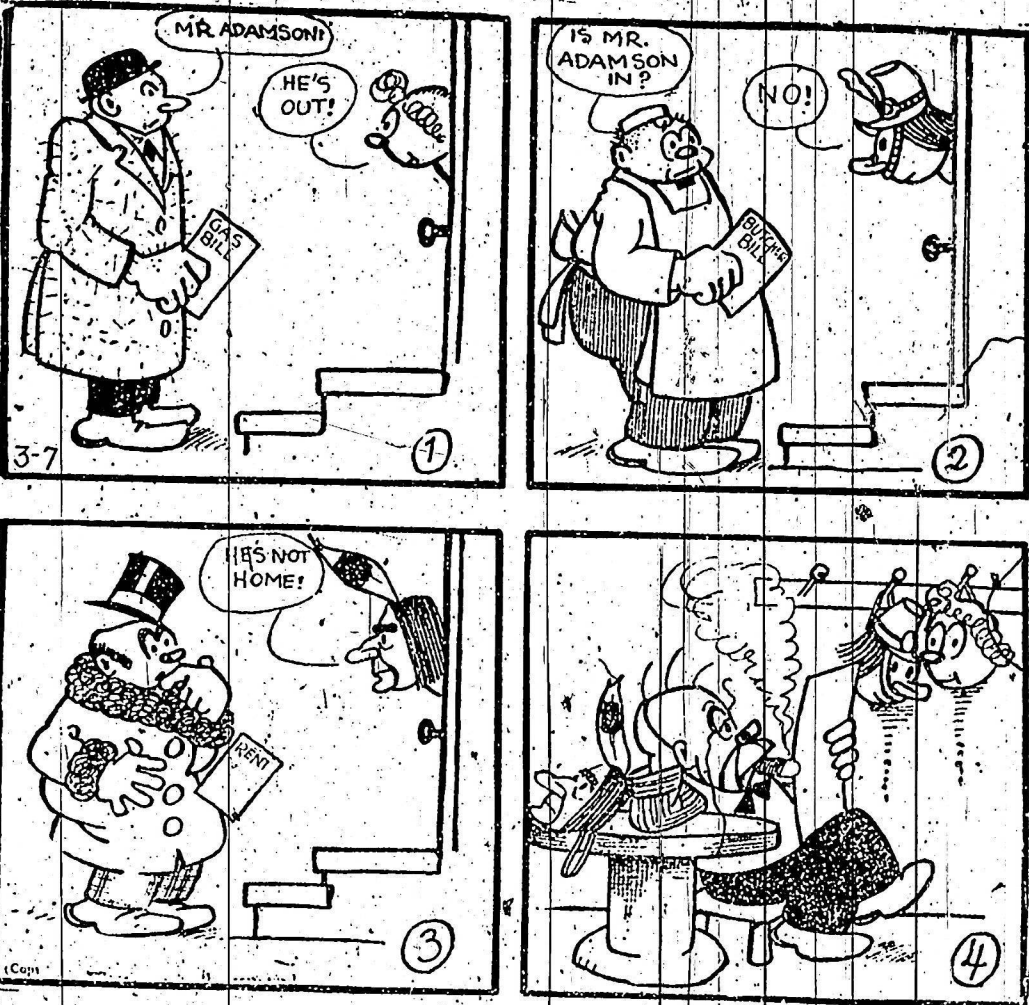
You Can't Always Believe What You Hear.