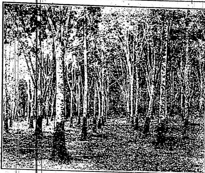
TAKE A "RUBBER" AT THIS.

From goldfishes to tires and in a thousand ways between the two, the modern world would be entirely lost without rubber. It is a key product that makes the wheels of progress go round. But common as it is, the knowledge of the finished product so that there is not a man, woman or child who has not seen it in some form or other, there are a few of us who have never seen a rubber plantation, in full bloom and in its native beauty, and who have never seen a rubber tree in its native beauty, and who have never seen a rubber tree in its native beauty.