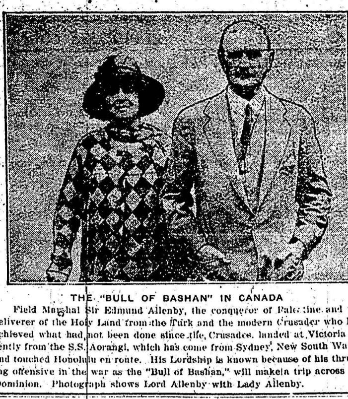
THE "BULL OF BASHAN" IN CANADA. Field Marshal Sir Edmund Allenby, the conqueror of Palestine...