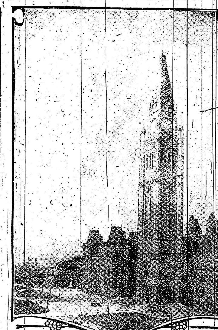
Since the recent removal of the scaffolding which clouded the classic beauty of Victory Tower, the above is the first published view of the new complete memorial which crowns Parliament Hill, Ottawa. The old building is still to be installed. The old buildings were destroyed by fire, February, 1916.

AGE-A PARADOX By T. H. Ainsworth, Nanaimo, B.C.