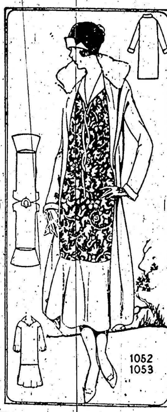
ENSEMBLE SUIT OF UNUSUAL SMARTNESS.

There is no getting away from the fact that the fashion of the day is the fashion of the future. The designer of the ensemble suit is a woman who is a woman of the future. She is a woman who is a woman of the future. She is a woman who is a woman of the future.