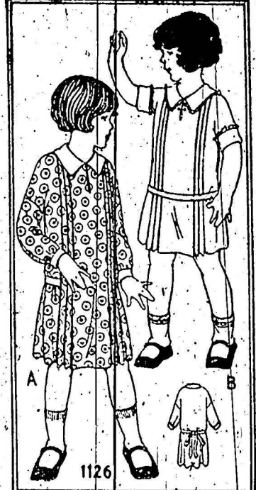
FOR HOME OR THE STREET.

July 28. The Council at Jerusalem. Acts 15: 1-29. Golden Text—We believe that through the grace of the Lord Jesus Christ we shall be saved. Acts 15: 11.