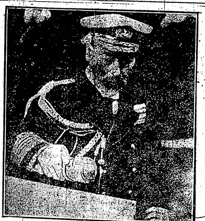
One of the best photographs of His Majesty, taken in the corner of the magnificent London building to be occupied by Lloyd's famous insurance brokerage exchange.