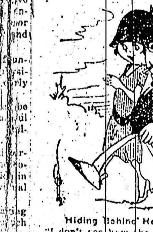
Hiding Behind Her Face.