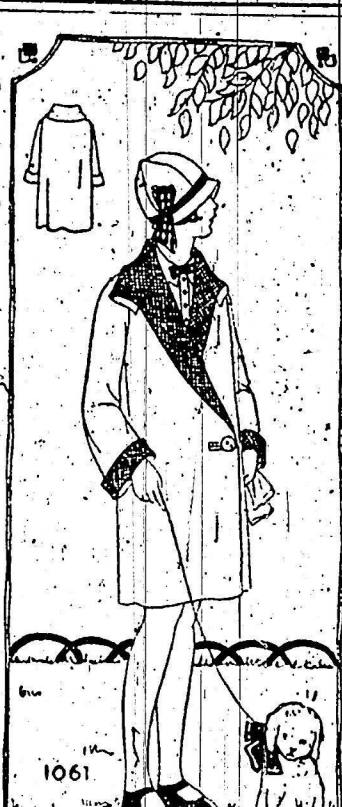
THE LITTLE LADY'S COAT

Additional text for the kitchen garden club article.