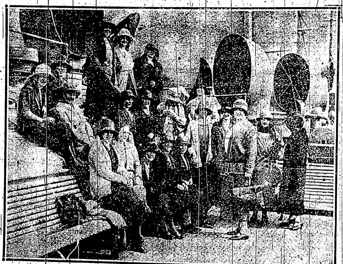
This group shows part of a large party of Scotch domestics, who called from Glasgow to Canada on the Canadian Pacific line. "Mont Laurier." These girls are all going out to assured posts in various parts of Canada.