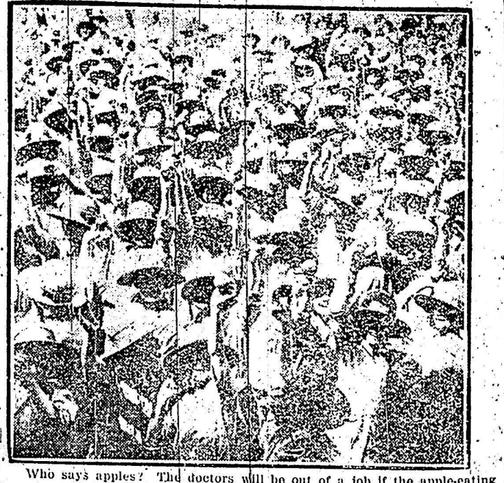
Who says apples? The doctors will be out of a job if the apple-eating habit takes hold of every gang of girls like it did this one.