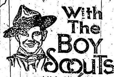
With The Boy Scouts and Help Others.