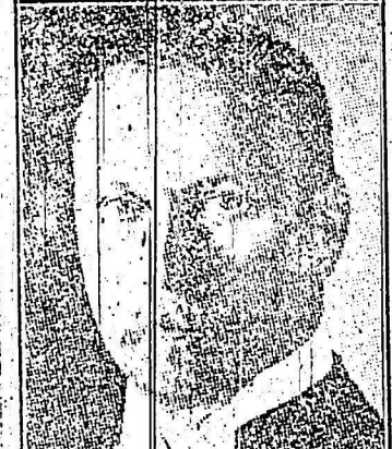
The Awakening of South Africa. Premier Smuts of South Africa, who is attending the Imperial Conference in London, is the central figure of the renaissance of the South African nation.

A despatch from London says—The Imperial Conference met on Monday morning and the morning session was devoted to the discussion of the Greek dispute. The conference was held in the presence of the British, French, Italian, and American representatives.