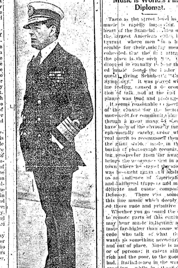
Sir Hamar Greenwood, the only Canadian defeated at the elections.

A despatch from London says—From the viewpoint of the Canadians directly engaged, the elections have been a decided success. With the exception of Sir Hamar Greenwood, all the Canadians running were known to have been returned, although their politics were variously representative of every part of the Empire.