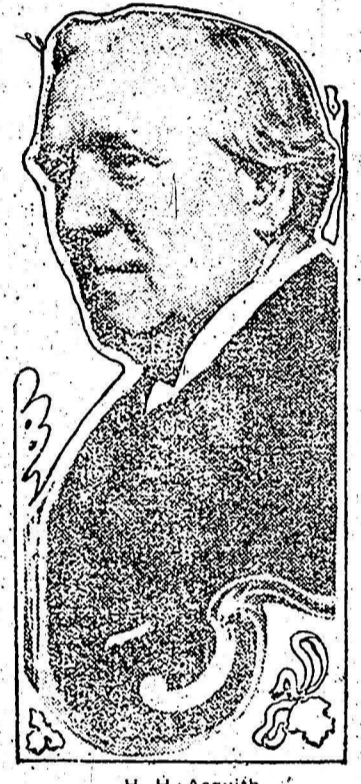
H. H. Asquith He doubts that his wing of the Liberal Party is flirting with the British Empire.

A despatch from Constantinople says—The Turks have been steadily strengthening their position in the city since the arrival of the Allies. The presence of the Allies has prevented any massacre of the Turkish population. The Turks are being treated as a separate nation and their rights are being respected. The Allies are doing their best to bring about a settlement of the Greek-Turkish dispute.