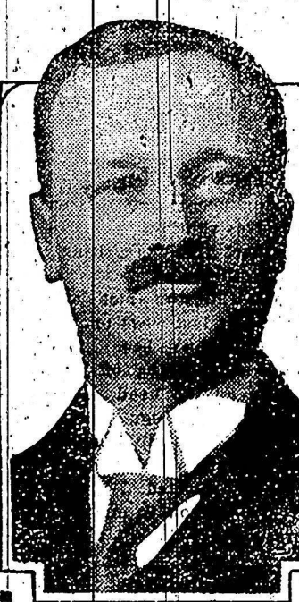
Hon. E. L. Patenaude. Who is slated to succeed Mr. Arthur Sauve as leader of the Opposition in the Quebec Legislature.