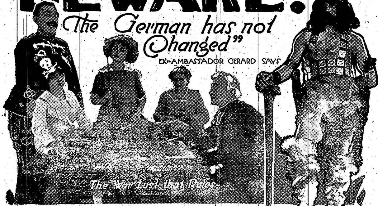
The War first that Paves