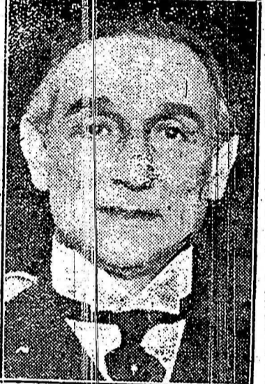
Slated for the East

$25,000,000 Credit Extended by Canada in Unsatisfactory Condition.