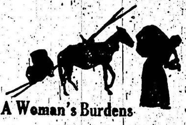
A Woman's Burdens