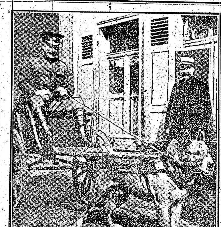
BRITISH MAJOR'S DOG-CART. By way of variety, when they are off duty, some miles behind the trenches in France, British officers have "harness races" with real "dog-carts" and dogs. The picture shows the champion of one regiment and his owner.

A despatch from London says: The Rotterdam correspondent of the Daily Mail telegraphs: "The Germans endured during the week-end a severe and sustained British artillery fire from Het-Sas to Lens. The German artillery was unable to reply adequately. This is doing much to destroy the morale of the German soldiers."