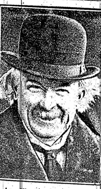
Are We Downhearted!