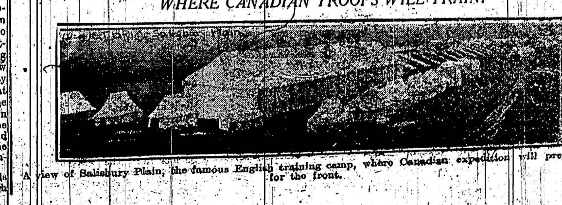
A row of Salutory Plain; the famous English training camp, where Canadian expedition will prepare for the front.