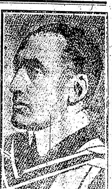
Sir Edward Carson, Leader of Opposition to Home Rule in Ireland.