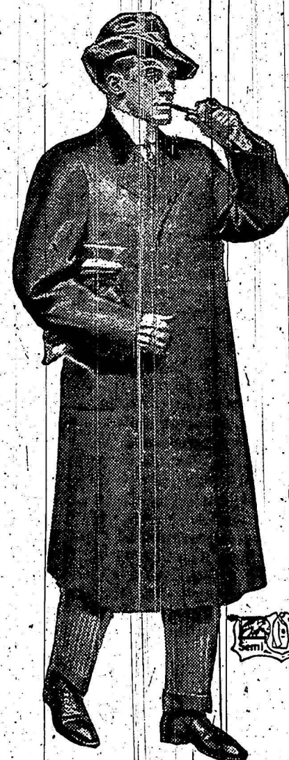
Come to this store for the best-good Shoes and Rubbers.

Our showing of new Fall Styles in Suits and Overcoats is the "Best Ever." Never before have the people of Markdale and vicinity had the opportunity of inspecting such a large and complete stock as we have just received.