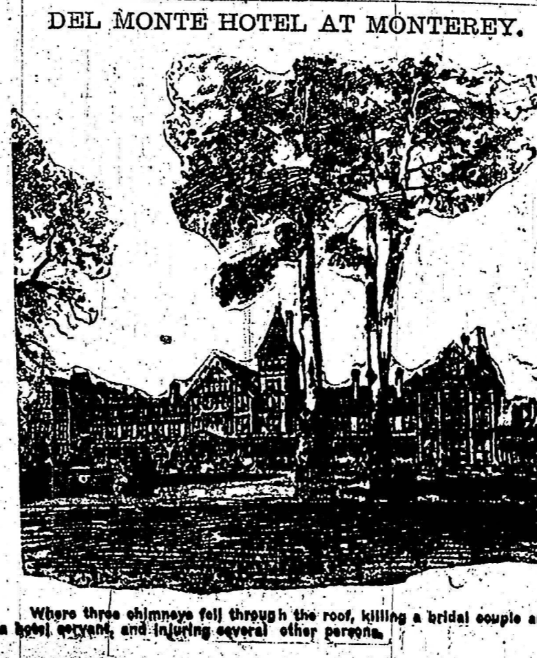
DEL MONTE HOTEL AT MONTEREY.