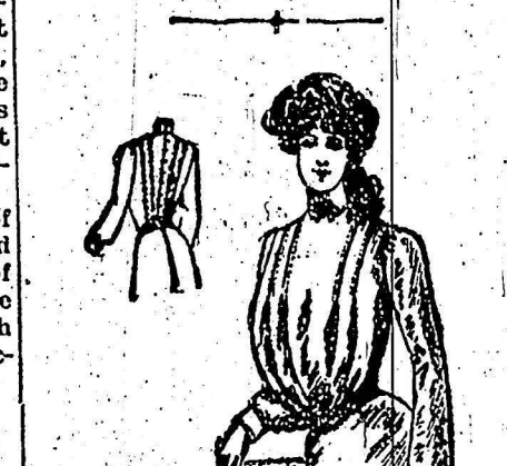
MISSISS' SHIRT WAIST.