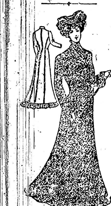
LONG COAT, 42 to 48 Bust.

THE PROPOSAL OF MARRIAGE. "I have called, Mr. Wealthyman to tell you frankly that I love you, and that I have her affection returned, and I hope you will give your consent for her to become my wife. I am not a rich man, but we are young and strong and are willing to fight the battle of life together, and I hope you understand me."