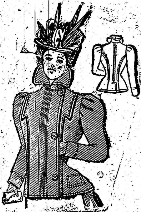
Ladies Jacket of best quality English Kersey, double breast, 6 large pearl buttons, turn down collar, trimmed with broadcloth strapping and lined throughout with pure Silk Taffeta, regular price $14.50 ..... 7.50

We bought these at a fraction of their original cost and are going to turn them over to you in the same way. These are the newest American and Canadian Goods, perfect in every way, splendid colorings, beautifully trimmed, no two garments in the whole lot alike, which assures every lady the much coveted exclusiveness. Here's a description of a sample lot, and the prices we're going to sell them at. If you want first choice come early. If you can't come early drop us a card giving us the size and color and we will lay it aside for you. The whole lot can be judged by these items.