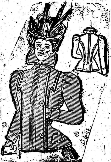
Ladies Jacket of best quality English Kersey, double breast, 6 large pearl buttons, turn down collar, trimmed with broadcloth strapping and lined with pure Silk Taffeta, regular price $14.50 ..... 7.50

We bought these at a fraction of their original cost and are going to turn them over to you in the same way. These are the newest American and Canadian Goods, perfect in every way, clever dyes, beautiful trimmings, no two garments in the whole lot alike, which assures every lady the much coveted exclusiveness of a sample lot, and the prices we're going to sell them at. If you want first choice come early. If you can't come early drop us a card giving your name and address for you. The whole lot can be judged by these items.