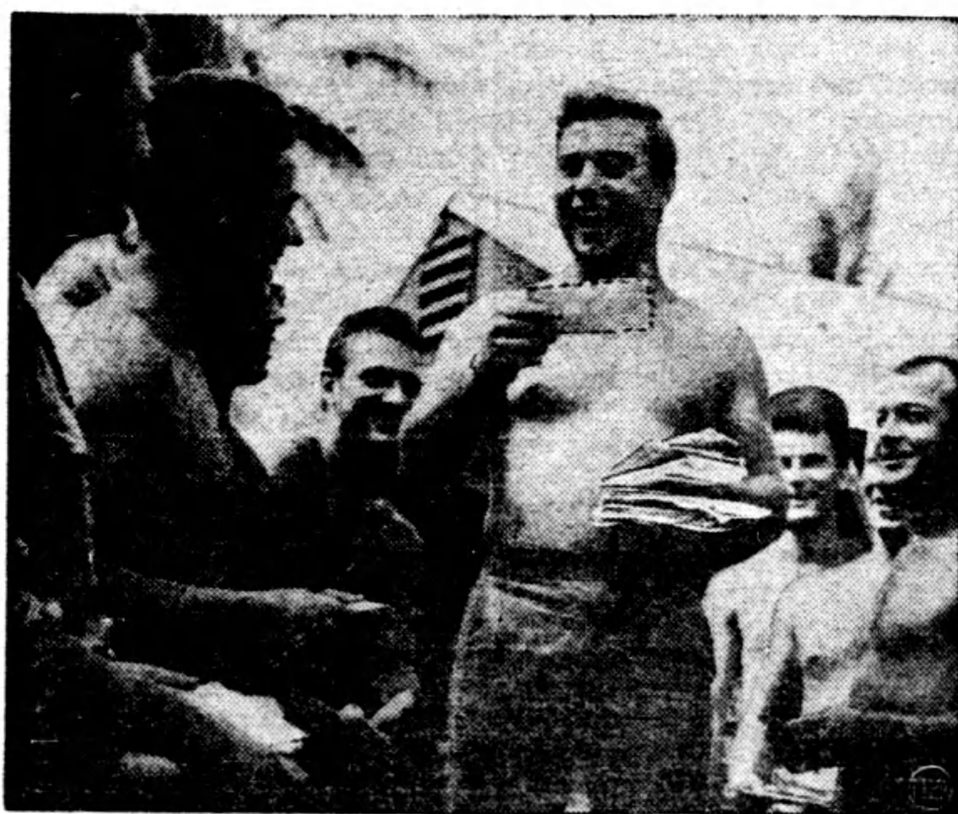
Popular as Santa Claus is this mailman distributing letters to fighting men on Espiritu Santo, New Hebrides.