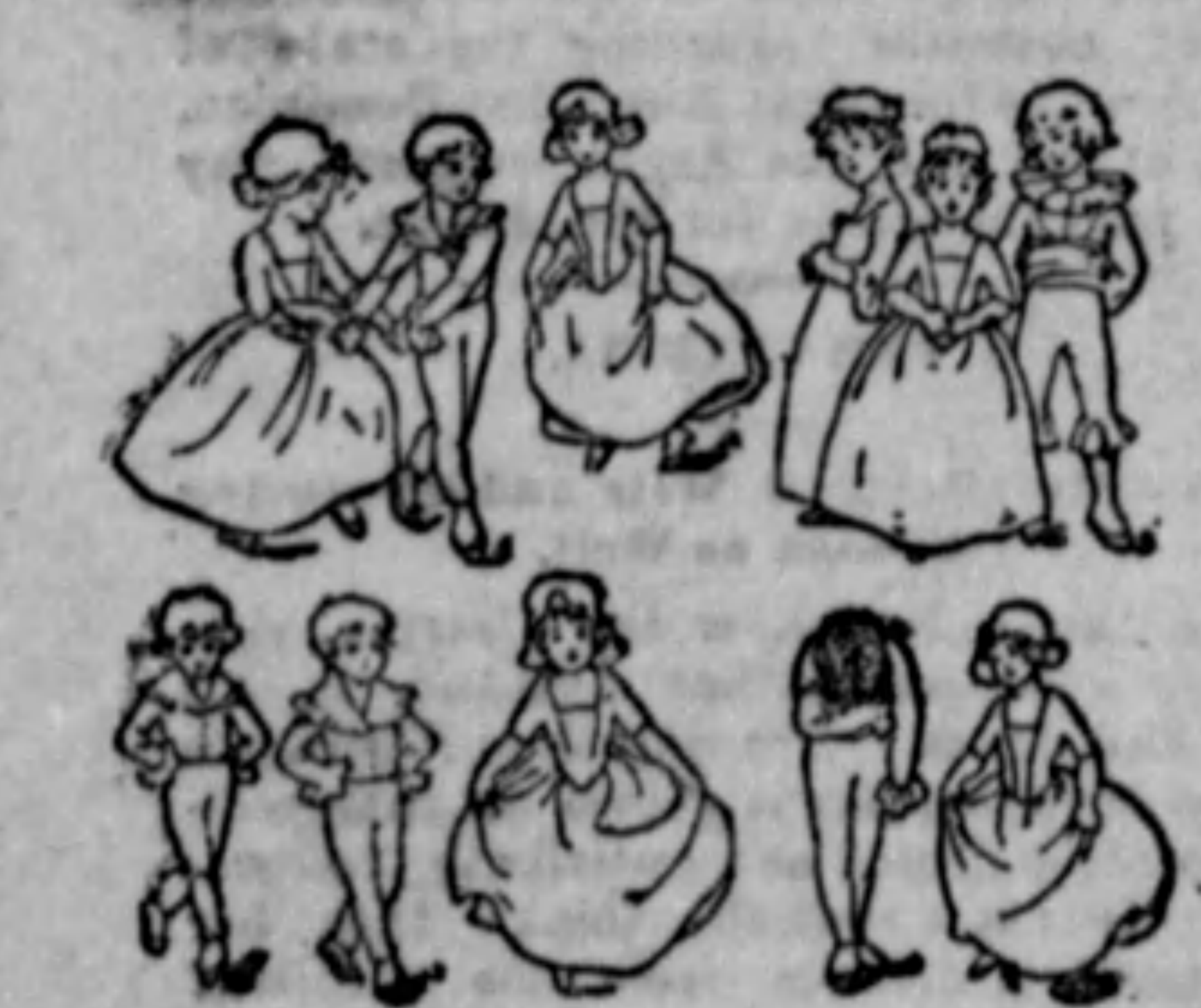
A FAMILY GROUP