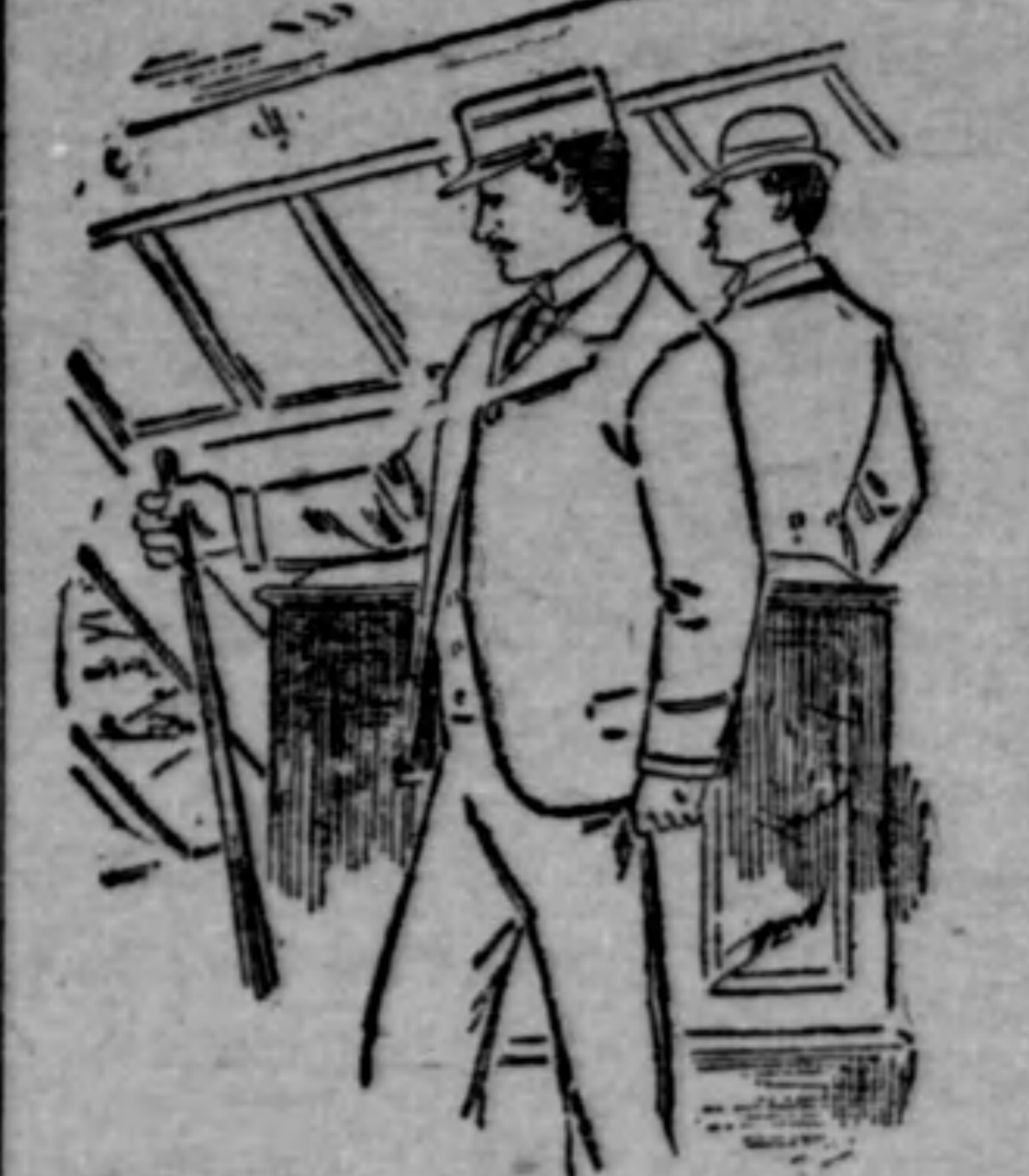
AS THE ENGINEER WILL APPEAR IN THE CABIN.

In like manner the horizontal wheels may be made use of in gaining speed by shifting